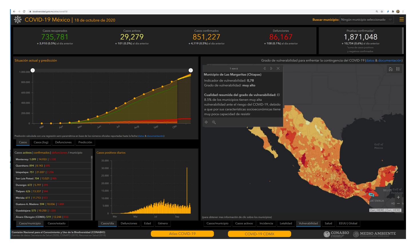
Figure 4: Municipal vulnerability map implemented in interactive COVID-19 dashboard / Mapa de vulnerabilidad municipal ante COVID-19, implementado en un tablero interactivo

There are multiple ways to construct a municipality vulnerability index for COVID-19. This article presents a vulnerability index for COVID-19 at municipal level based on socioeconomic/sociodemographic and health infrastructure data. Our results illustrate that the majority of the municipalities show medium vulnerability facing COVID-19 (46.6%). High (24.6%) and very high vulnerable municipalities (8.5%) can be found primarily in the southern and south-eastern parts of the country